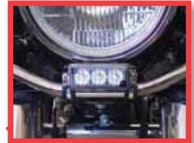
Optional Model RBKTHD5, under headlight mounting bracket kit for one TIR3, LIN3 or LINZ6 horizontal mount lighthead