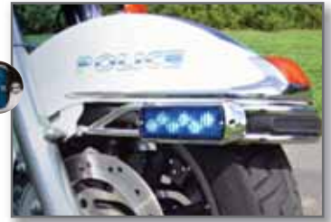
Optional 500 Series TIR6 Super-LED