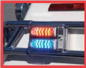
Optional Model RBKTHD2 , side saddle bag crash bar mounting bracket kit for two TIR3, LIN3 or LINZ6 horizontal mount lighthoods