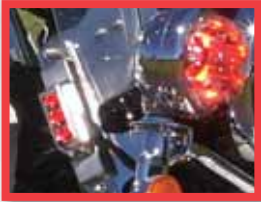
Optional Model RBKTHD1, windshield mounting bracket kit for one TIR3, LIN3 or LINZ6 vertical mount lighthead