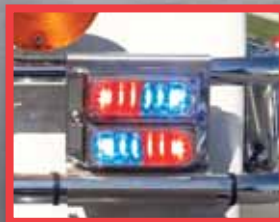
Optional Model RBKTHD3 , rear saddle bag crash bar mounting bracket kit for two TIR3, LIN3 or LINZ6 horizontal mount lighthoods