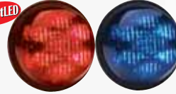
Optional 4" Round TIR6 Super-LED with extended lens