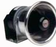
Optional SA350MH Speaker