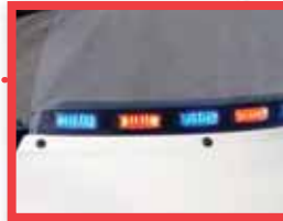
Optional Model M052J, LINZ6 motorcycle windshield light array