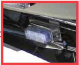
Optional Models RBKTHD4L (road side) RBKTHD4R (curb side) under radio box mounting bracket kit for one TIR3, LIN3 or LINZ6 horizontal mount lighthouse